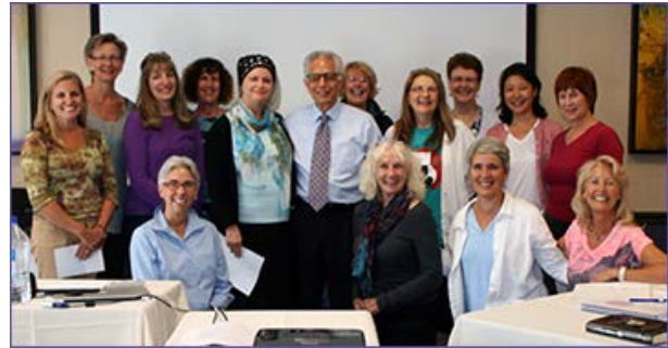
CTTB1 - September, 2013 - Raleigh, NC