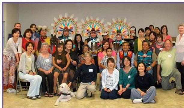
Hopi Nation tribal members, students, Teaching Assistants and students who traveled from a school in Japan attend the CST class September, 2013 on the Hopi Reservation.